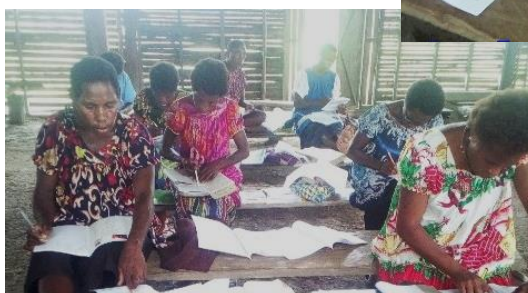
Pictures from the Wogamush District course held September 6-10, 2021. 24 Teachers from four village churches.